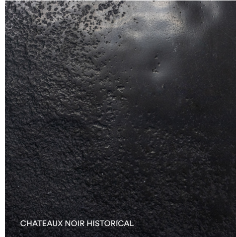
CHATEAUX NOIR HISTORICAL