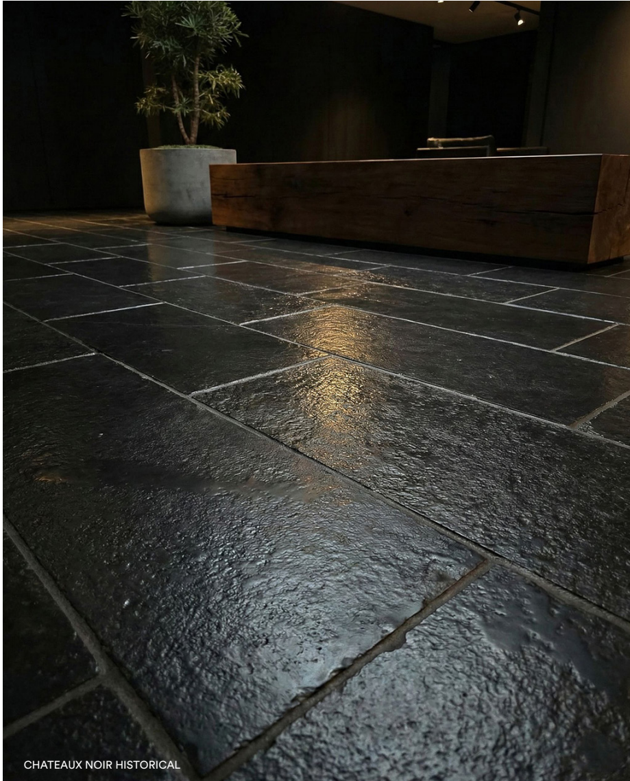
CHATEAUX NOIR HISTORICAL