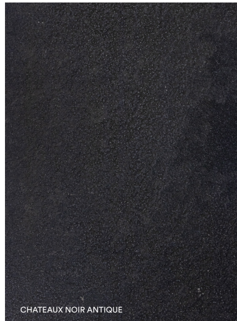
CHATEAUX NOIR ANTIQUE

The Chateaux Noir Limestone brings an authentic, time-worn character to any contemporary decor. The deep, bold black tone offers a unique and stunning impact, with the 'historical' surface and edges there is an unmistakable depth of old-world luxury and glamour. Pair the Antique surface for an indoor/outdoor flow, with its lightly structured finish for exterior spaces where slip-resistance may be required.