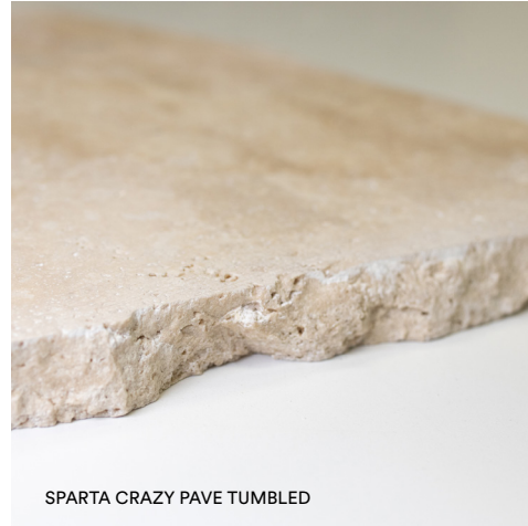
SPARTA CRAZY PAVE TUMBLED