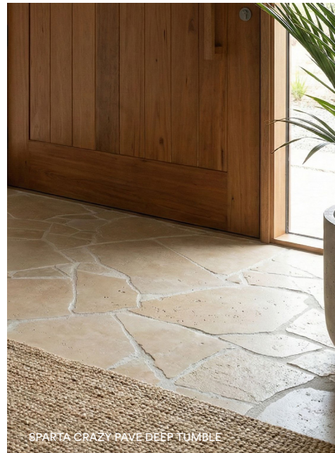
SPARTA CRAZY PAVE DEEP TUMBLE

Originating in ancient Italy, Crazy Paving flooring offers an organic and unique surface design for use in both internal and external spaces. This stunning installation style features irregular stone pieces laid randomly to ensure a unique aesthetic in every application. Whilst it sits perfectly in stylish outdoor settings, it can add real organic texture and powerful visual impact when laid throughout interior floors and walls. This material is available in the classic more traditional and lightly tumbled style, or deep-tumbled for a more rustic and pitted design which is achieved through the extra tumbling processes.