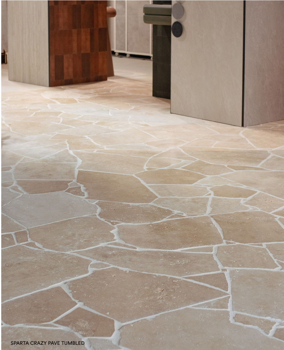
SPARTA CRAZY PAVE TUMBLED