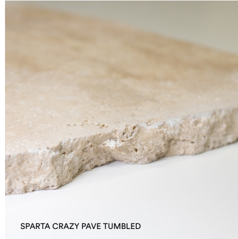
SPARTA CRAZY PAVE TUMBLED