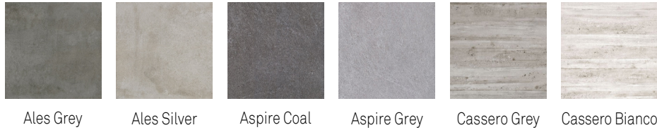
Ales Grey Ales Silver Aspire Coal Aspire Grey Cassero Grey Cassero Bianco