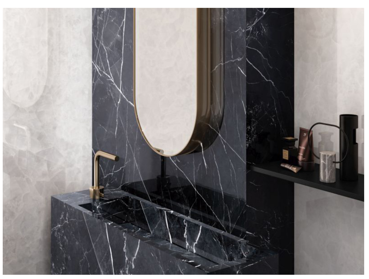
Tele di Marmo is a stunning collection of exquisite and unique marble designs which are highly expressive through striking colours and patterns. Unique decors complete the collection with meticulous detail, and offer interior design new levels in sophistication and design.

E: sales@qcg.co.nz | W: www.qcg.co.nz | P: 0800 525 585