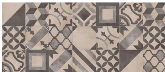
Square Decor Mix