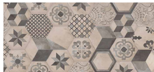
Hex Decor Mix