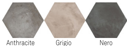
Anthracite Grigio Nero