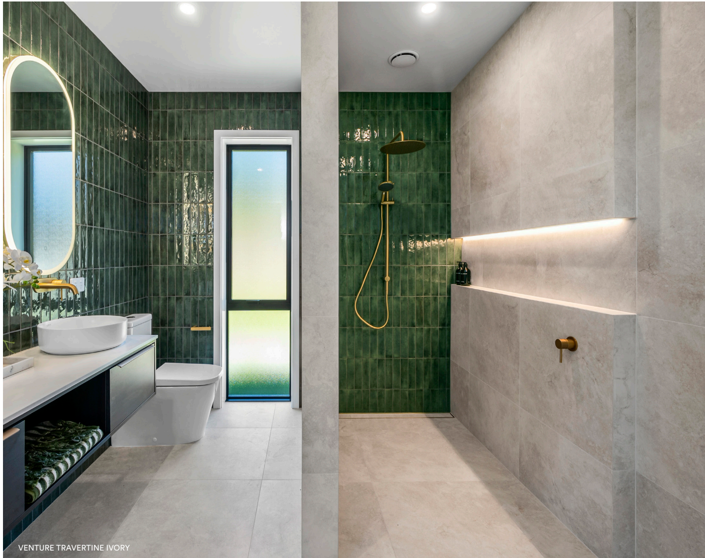
VENTURE TRAVERTINE IVORY

Characterized by the natural and classic hues of this famous Turkish stone, Venture Travertine captures the natural beauty in a stunning cross-cut design. Its soft, marble-like appearance and attractive earthy tones is the perfect solution for your next project.