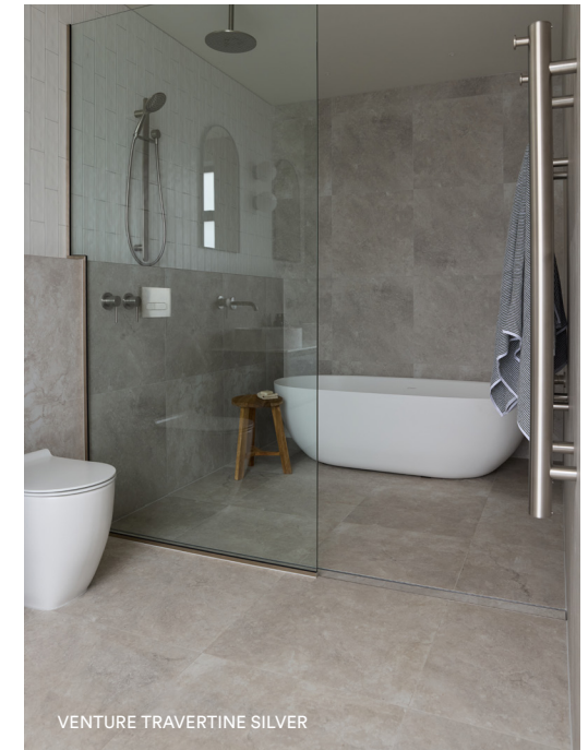
VENTURE TRAVERTINE SILVER

For New Zealand stock lines, please contact our Customer Care team on 0800 525 585. To check the full range of available formats, colours and surfaces, please visit www.qcg.nz and view the full range catalogue.