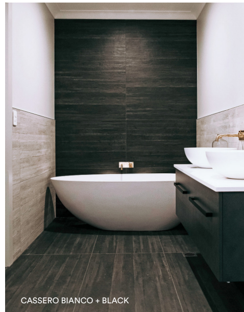
CASSERO BIANCO + BLACK

Cassero is a striking collection of industrial designed porcelain tiles in a range of popular tones. The raw 'shuttered concrete' effect which is seen in many current project designs is unmistakable, with natural texture and flashes of aggregate in the surface design.