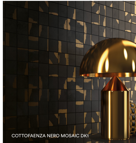
COTTOFAENZA NERO MOSAIC DK1