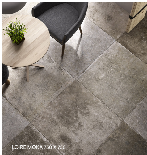
LOIRE MOKA 750 X 750