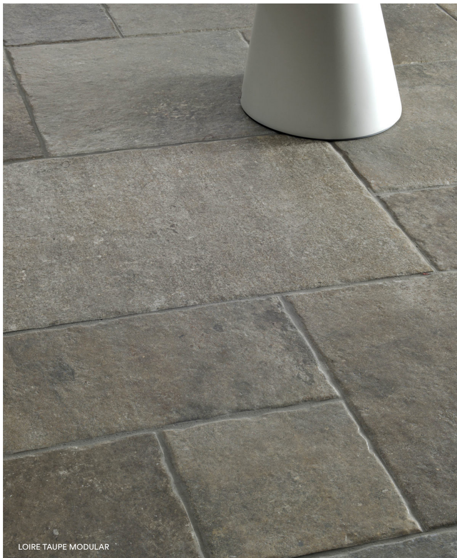
LOIRE TAUPE MODULAR