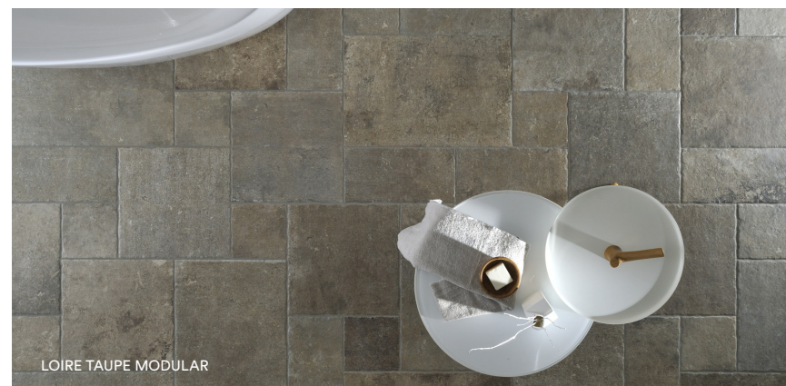
LOIRE TAUPE MODULAR

For New Zealand stock lines, please contact our Customer Care team on 0800 525 585. To check the full range of available formats, colours and surfaces, please visit www.qcg.nz and view the full range catalogue.