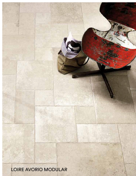
LOIRE AVORIO MODULAR

Loire is the epitome of Tuscan French style and design. Add classic charm to any space indoor and out with this stunning collection from Italy. Natural aesthetics create the unmistakable character and warmth this natural worn stone appearance offers, with all the benefits of high quality porcelain.